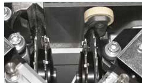
K-2 Radius end cutting unit Cut and radius in a single operation.