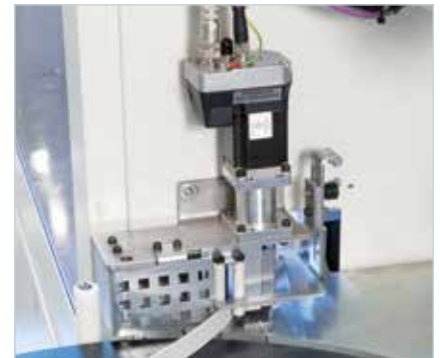
Kit for the automatic edge loading Fast, simple and safety edge changeover.