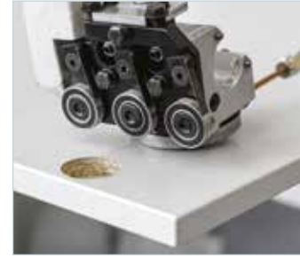
Nesting kit To process panels coming from nesting cycle.