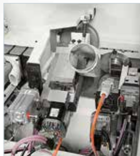
R-HP Trimming-Chamfering unit Quick changeover between 2 different radii, infinite thin edges and solid wood tipping thanks to Multiedge devices.