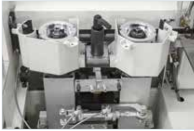
RT-V1 premilling unit A perfect panel surface for an excellent joint line.