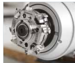
Round 2-A unit 2-motor unit and Multiedge device for machining 2 different radii, each with a dedicate tool.