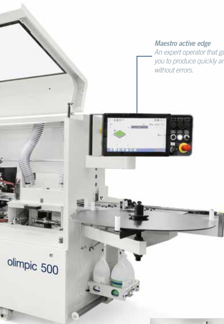
Maestro active edge An expert operator that guides you to produce quickly and without errors.