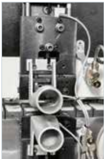
RC-N glue scraping unit It eliminates any glue excessing in the joint between edge and panel. Nesting processing.