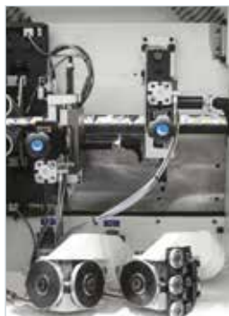
RAS-A edge scarping unit Simple and quick change of the machining radius with the replacement of the tool kit.