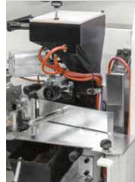
SGP-E glue pot Perfect joint line and use of EVA and PUR glue.