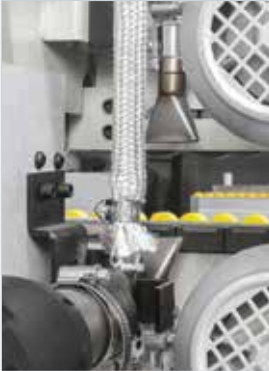
ID 3000 edge brightening unit It brightens the colour of plastic edges by heating them with hot air.